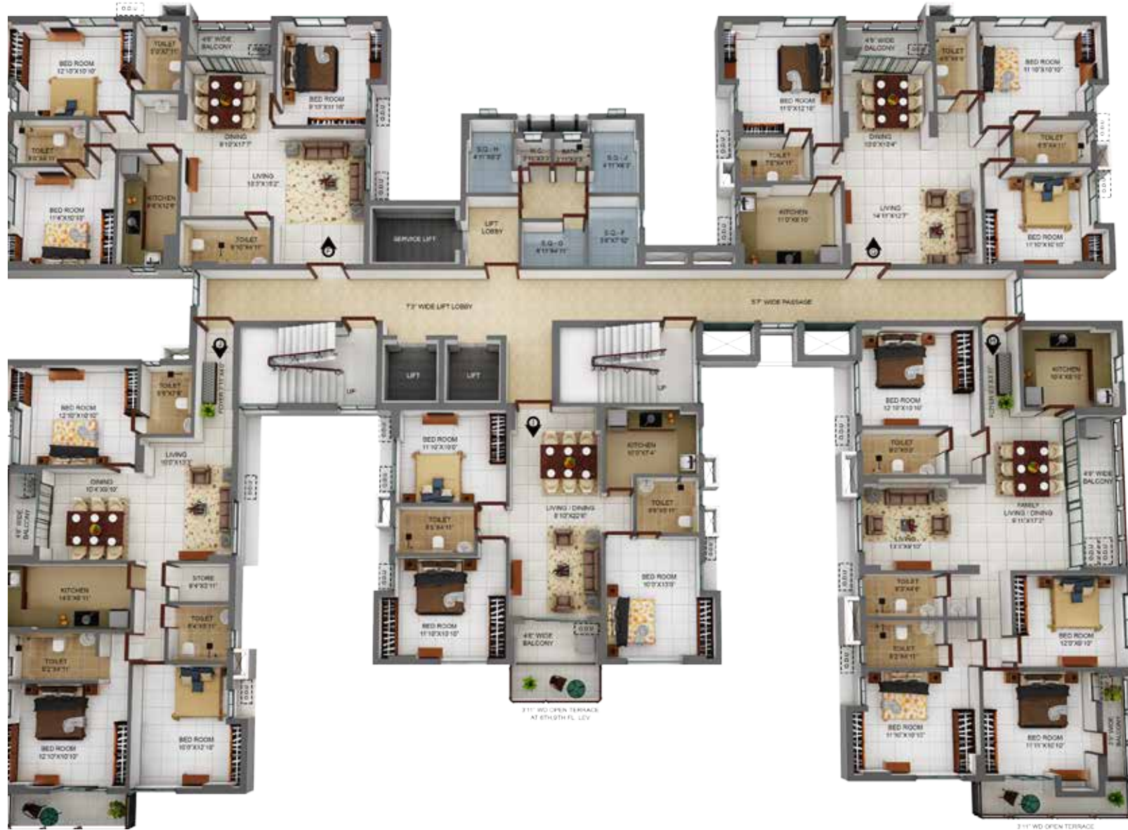
Tower-2 | 6th & 9th Typical floor plan (Area as per WBHIRA)