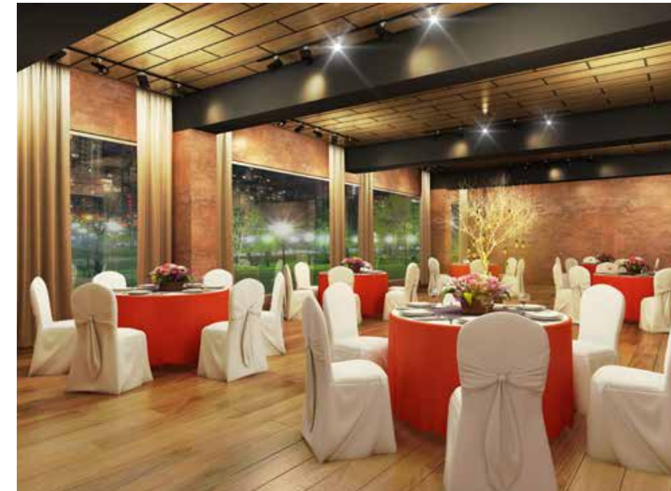
AC Community Hall