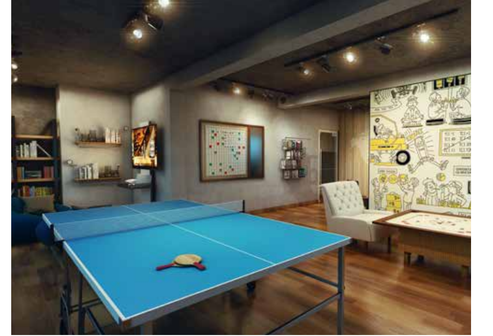
AC Indoor Games Room