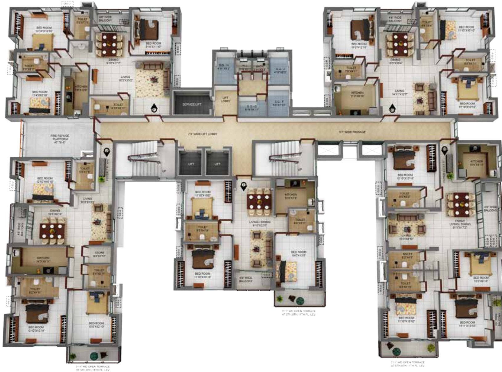
Tower-2 | 5th, 8th & 11th Typical floor plan (Area as per WBHIRA)