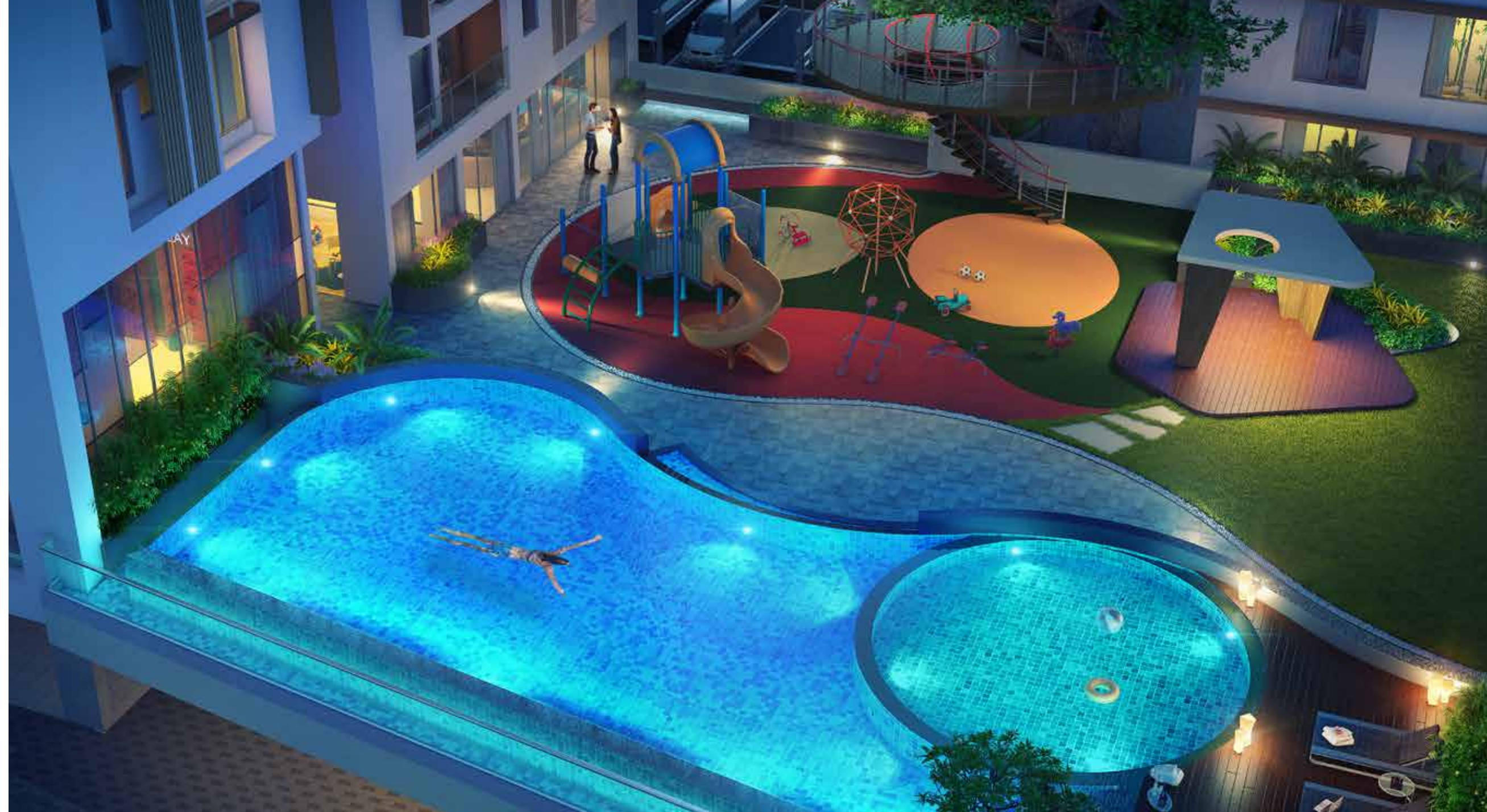
Infinity Swimming Pool