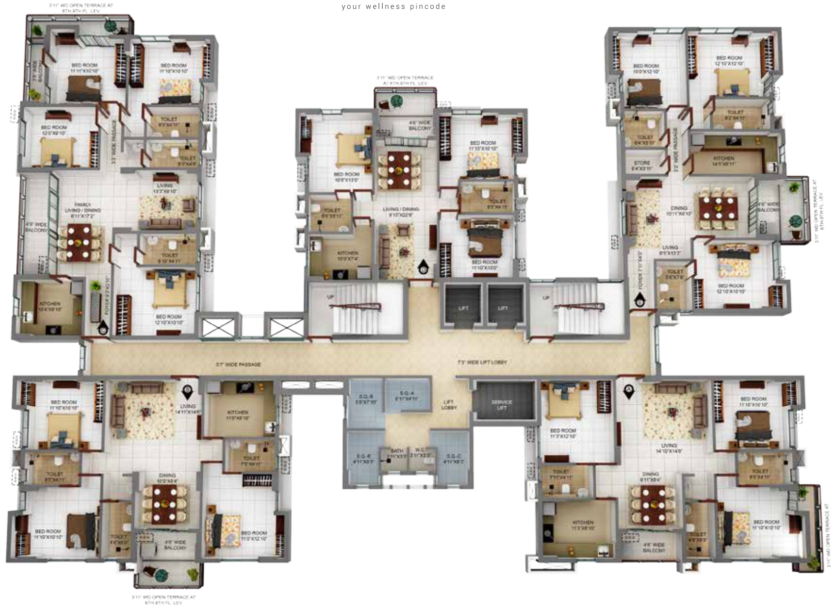
Tower-1 | 6th & 9th Typical floor plan (Area as per WBHIRA)