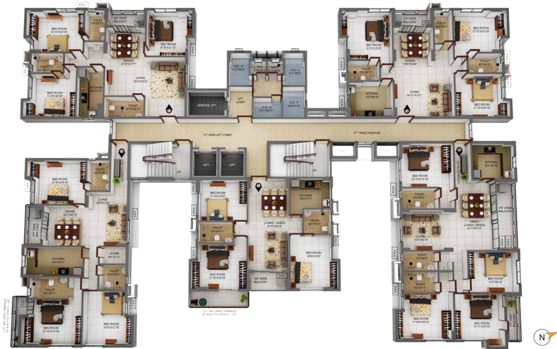
Tower-2 | 4th, 7th & 10th Typical floor plan (Area as per WBHIRA)