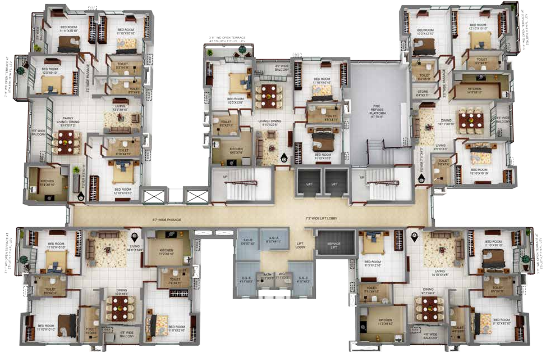
Tower-1 | 5th, 8th & 11th Typical floor plan (Area as per WBHIRA)