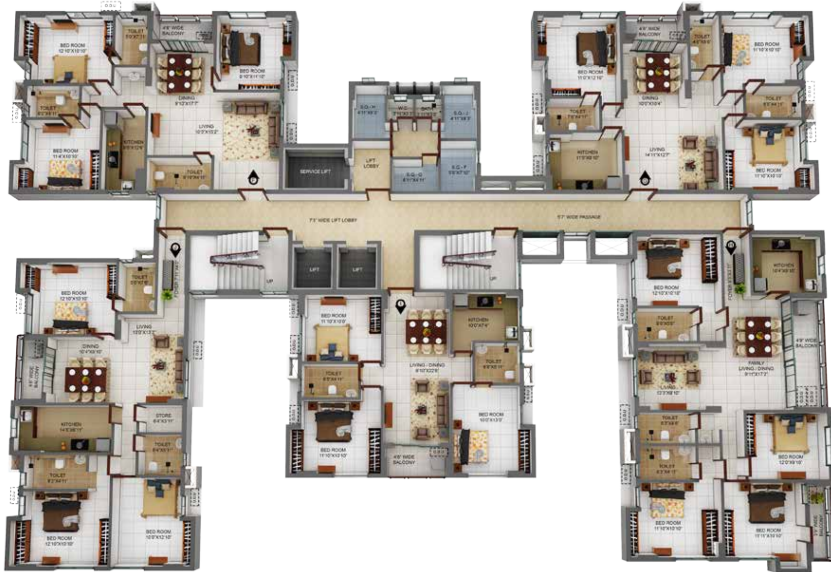
Tower-2 | 2nd & 3rd Typical floor plan (Area as per WBHIRA)